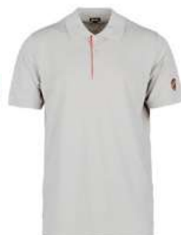
8530 White Grey / Red