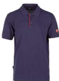
4130 Saylor Blue / Red