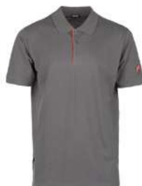
8430 Dark Grey / Red