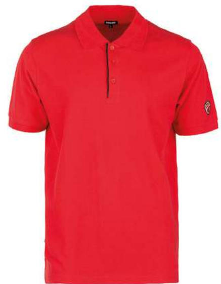
3080 Red / Black